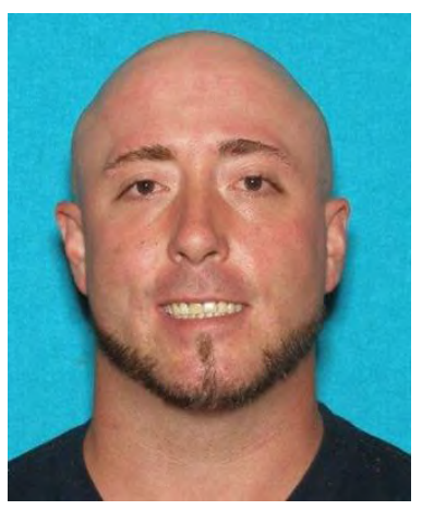
BURGLARY SUSPECTS ARRESTED IN RANGELY

On the evening of 11-18-2016, Rangely dispatch received a call. The caller stated they just saw two suspects who are wanted out of Vernal Utah, inside the White River Market in Rangely. The caller stated the man and woman left the store and were possibly heading to the Rangely Pharmacy, they were traveling in a green utility vehicle.