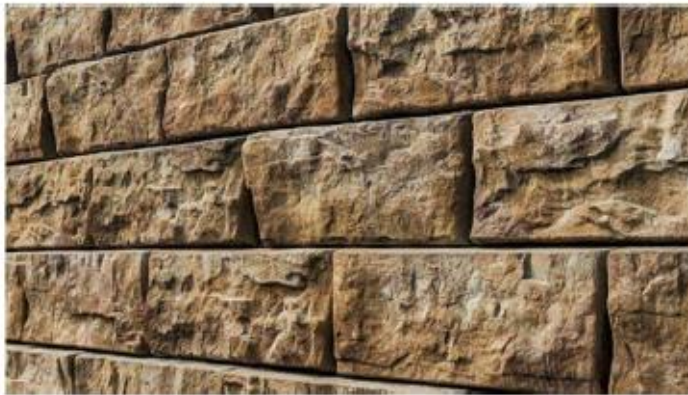
KINGSTONE BLOCK EXAMPLE