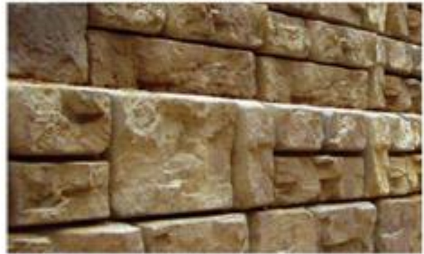
LEDGESTONE BLOCK EXAMPLE