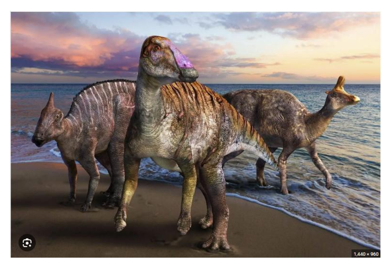
Rendering of Dinosaur that was uncovered by CNCC 10 miles south of Rangely