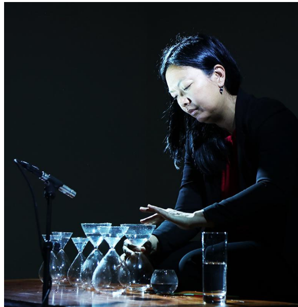
Susie Ibarra

Purchase tickets for Susie Ibarra here .