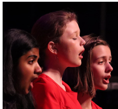
Colorado Springs Children's Chorale

The award-winning Colorado Springs Children's Chorale is celebrating its 45 th Anniversary of music-making throughout the state of Colorado and around the world. CSCC is known for their fast-paced and eclectic musical presentations of choral music from classical to world music, and Broadway tunes to inspirational selections celebrating the human spirit. The group is excited to perform in the Tank and share its musical message of a better world through song with all concert-goers. This concert will touch the hearts of people of all ages.