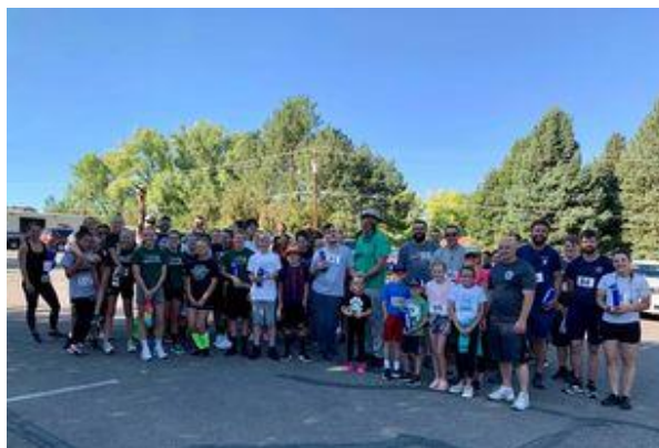
Fast, Flat and Free 5K 2022 Participants