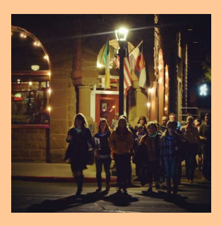
Durango Ghost Tour