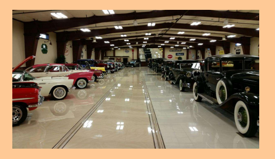
Rangely Automotive Museum

On July 13th at 8pm join Horsefly History Tours for the Hauntings and History: Durango Ghost Tour. This walking tour explores the haunted best haunted locations that Downtown Durango has to offer!